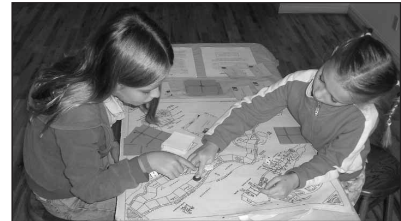
< Two girls playing "Stage Stop" while hanging out in the new educational space at the Park City Museum.

We are also pleased to announce the temporary exhibit "Back to School: Explore Park City's Classrooms," featuring Marsac school photos from the 1950s. Most of the photos were