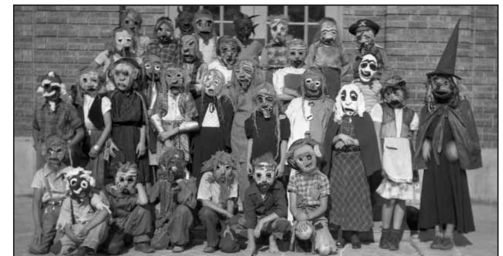
In 1947, Marsac School kids made wonderful paper masks for Halloween. Come visit the museum on October 31st to make your own!