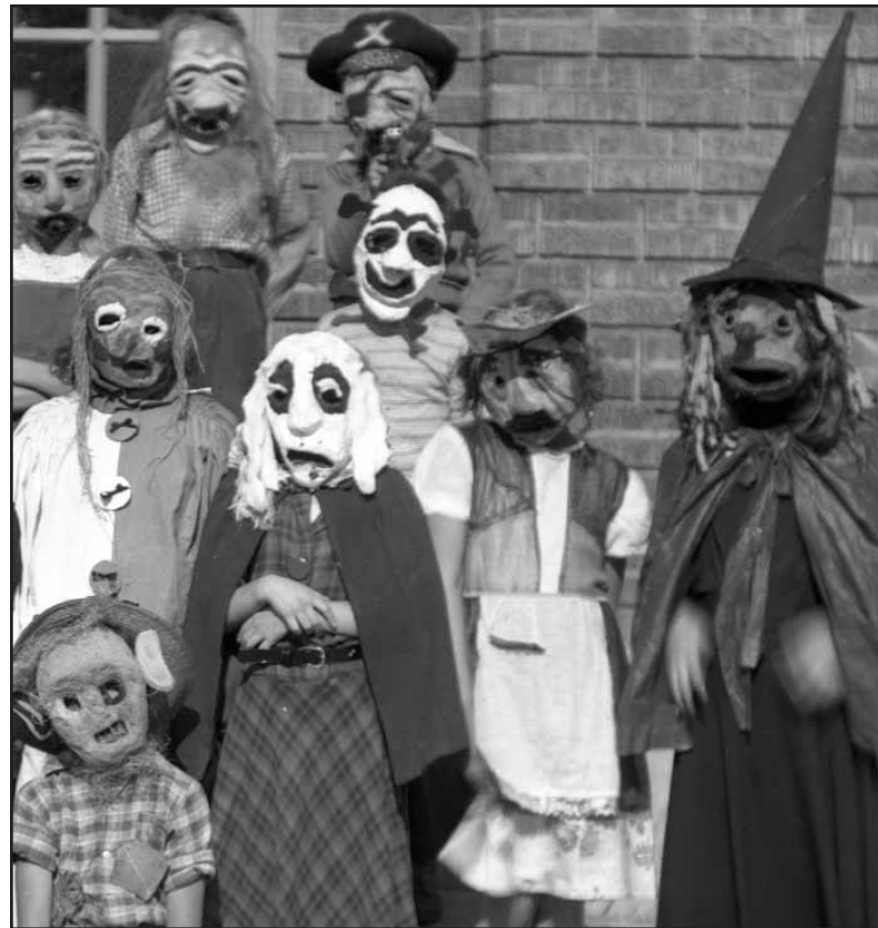
> Children at the Marsac School made Halloween masks in 1947

As part of Halloween on Main Street, the museum is also offering a mask-making activity on Tuesday, October 31. Stop by the Museum at 3:30pm, make a scary mask and wear it to go trick-or-treat along Main Street. We'll have candy, too!