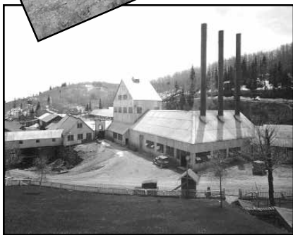
The Silver King Mine in Woodside Gulch