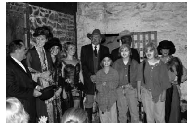
^ The cast of historical characters.

The response was overwhelming, and it was standing room only in the territorial jail. Even with two performances, we were sad to turn some visitors away. But the new Park City Museum will more than double the space for educational programs like this.