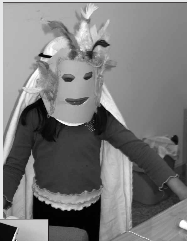
The kids were so proud to show off their beautiful Halloween masks.

Each month, we discover Park City history together: during Halloween, we made Halloween masks as they were made 80 years ago, and during