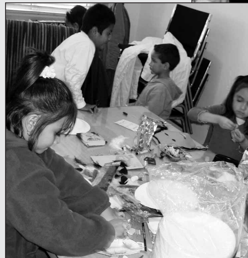
The kids at Aspen Villas got very excited about making Halloween masks and costumes.

This outreach program is set up on a monthly basis, and the next visit to Aspen Villas will take place at the end of February.