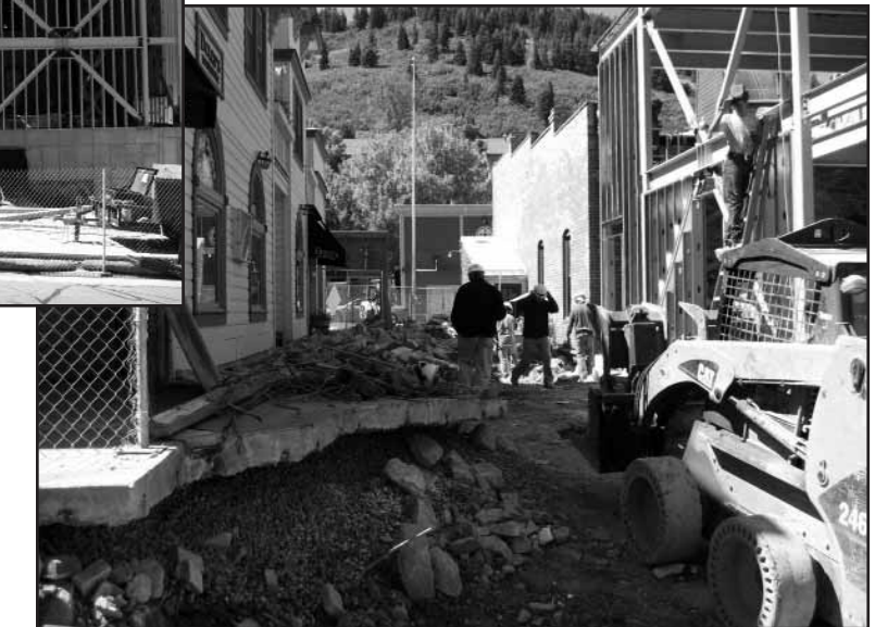
^ Dolly's Walkway - future location of the donor bricks.