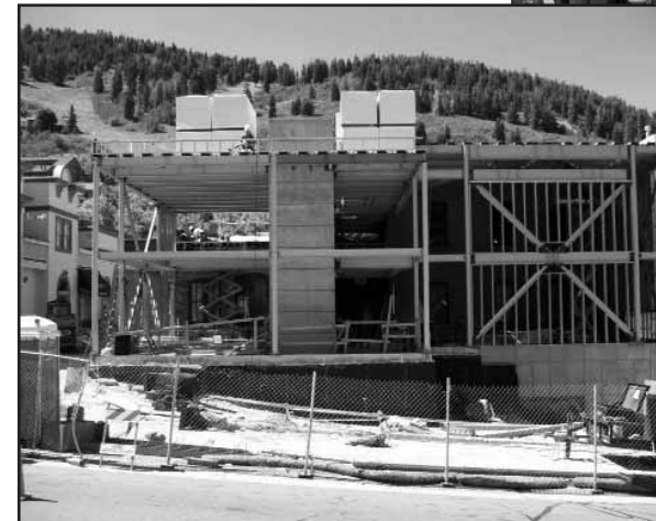
< The construction site as seen from Swede Alley.