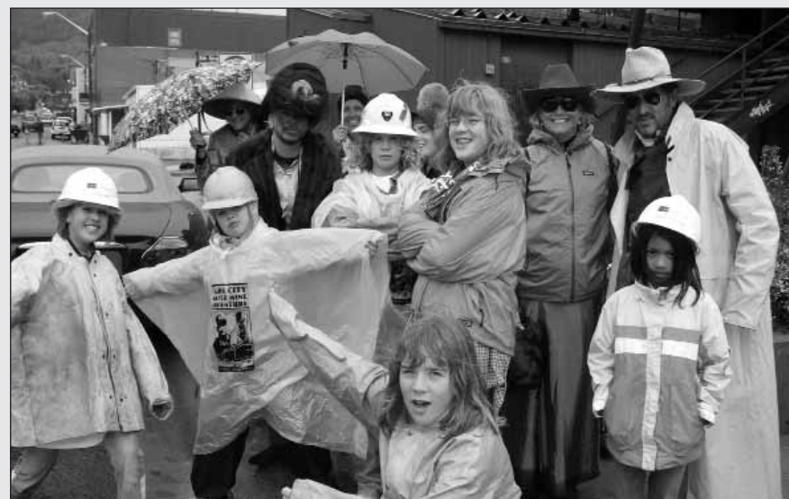
^ Our volunteers braved the bad weather.

A big THANK YOU to all volunteers who supported us for this year's Miners' Day Parade! The weather conditions were less than favorable, but nevertheless, miners, the Silver Queen, Mother Urban and many other characters from the past were there to march down Main Street with us! Thank you again! Without our great volunteers we couldn't accomplish all our different projects.