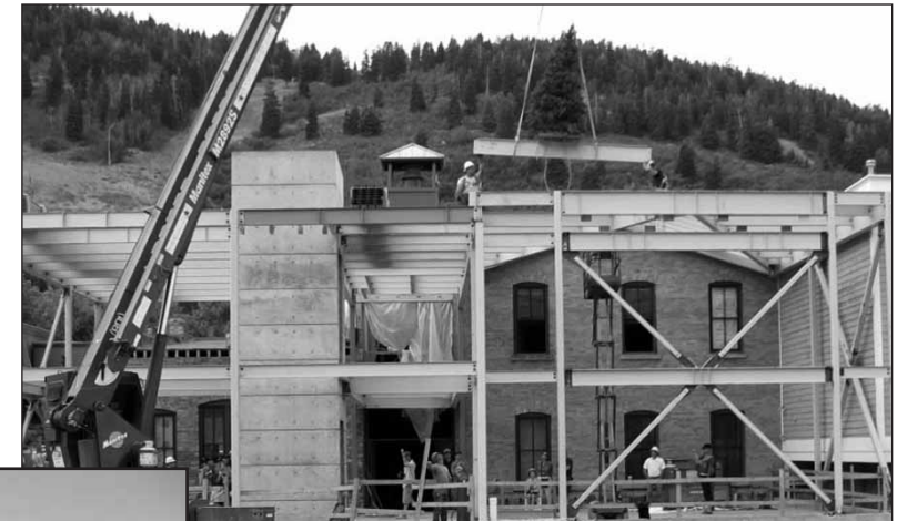
^ A tree is installed on the Museum during the tree topping ceremony.

As seen in the Park Record, ICS Layton Construction organized a topping out ceremony for the new Park City Museum. The finished steel structure was topped with an artificial pine tree for good luck and to ward off evil spirits, a European tradition from the Middle Ages.